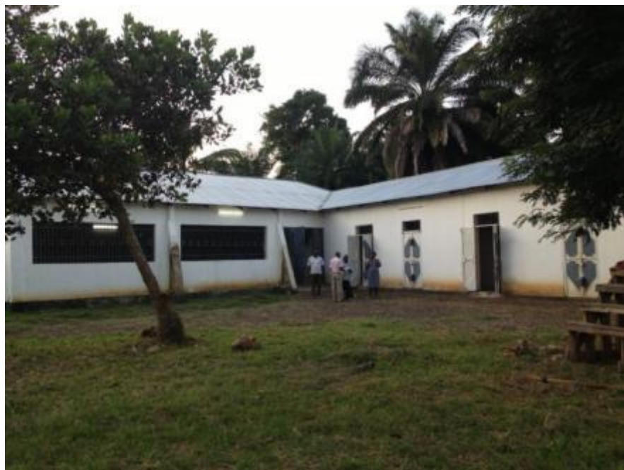
Our main warehouse / Kiela