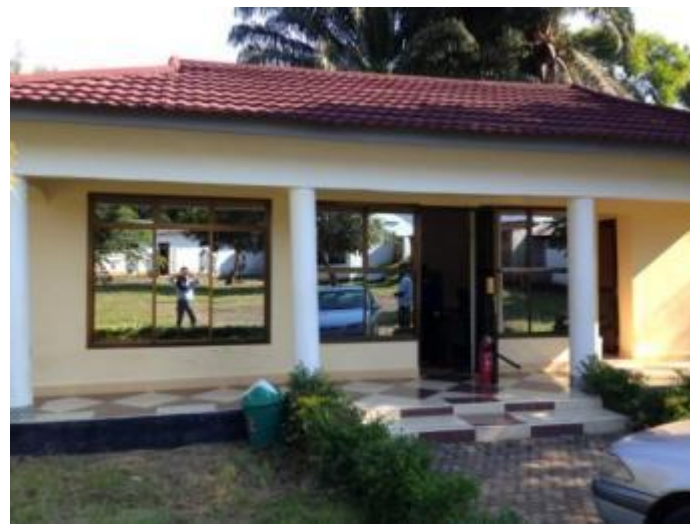
Our main office / Kiela *in same place as warehouse