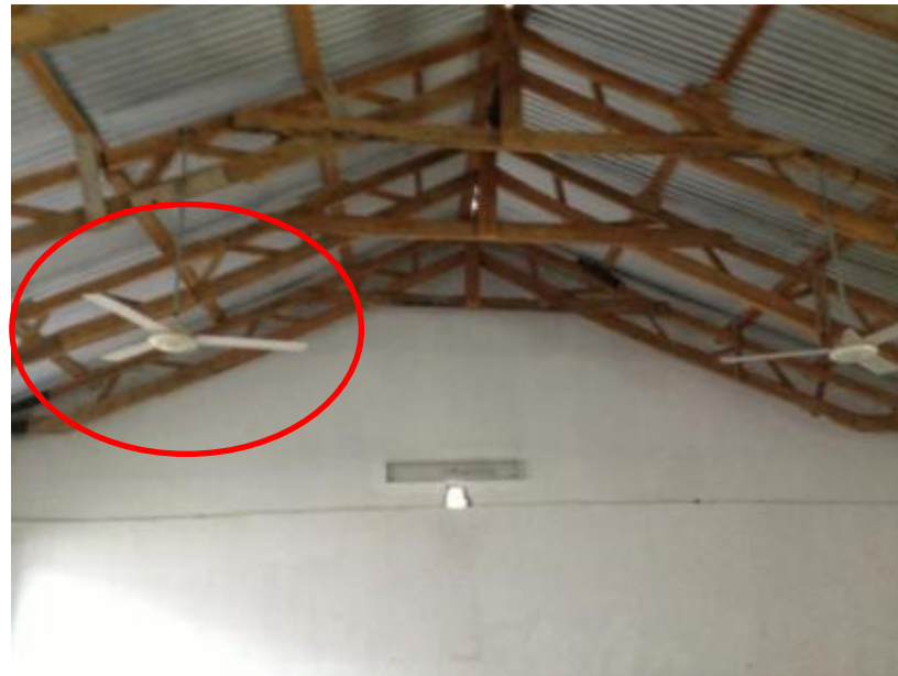
Fan to air circulation / Kiela